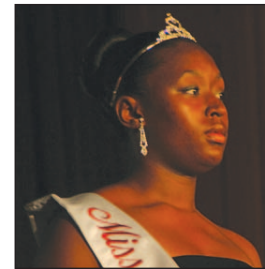
Photo Feature More homecoming: concert, coronation and choir ball Page 8

Campus Two students living with cerebral palsy. And thriving. Page 6